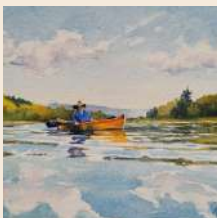
Upper Hudson Valley Watercolor Society