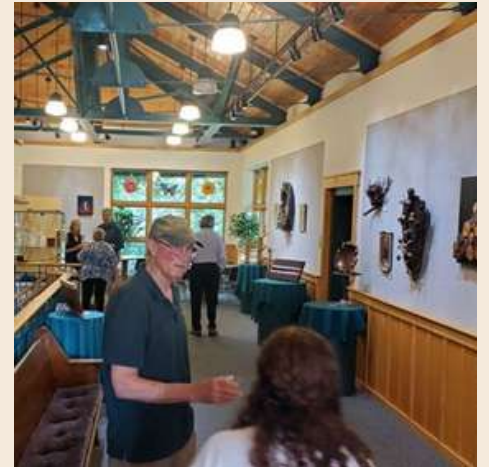
Adirondack Folk School Artisans Multiple Artists