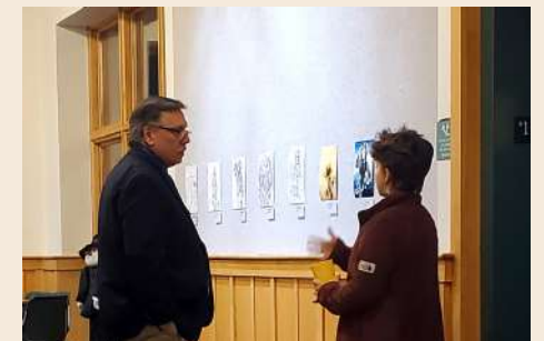
Johnsburg Central School Student Exhibit - Multiple Artists