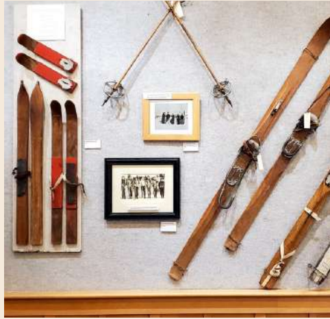
Daring Descents: Images of Mountain Sports Multiple Artists