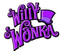
Best of the Best! Johnsburg Central School